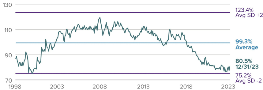
Russell 2000 vs. Russell 1000 Median LTM EV/EBIT 1 (ex. Negative EBIT Companies) 12/31/98-12/31/23

Fallout from the Internet Bubble saw small-caps need 456 days from their trough to match their previous peak, while it took 704 days for small-caps to recover their prior peak following their trough in the 2008-09 Financial Crisis. Each of these periods saw dramatic developments: the implosion of high-flying technology stocks in 2000-02 and a global financial catastrophe in 2008-09. The current period has seen ample uncertainty, and a record pace of interest rate increases yet lacks the existential threats that characterized the Internet Bubble and, even more so, the Financial Crisis. The latter period also saw less bifurcation between small- and large-cap returns. Yet based on our preferred index valuation metric of enterprise value to earnings before interest and taxes, or EV/EBIT, the Russell 2000 finished 2023 not far from its 25-year low relative to the Russell 1000.